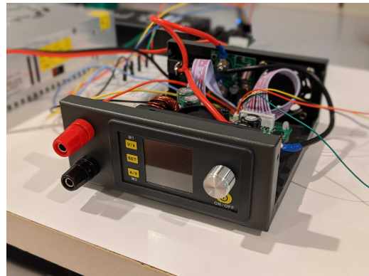
Figure 3: RD DPS5015 power supply, opened [7]

We used SHIMWARE to retrofit an RD DPS5015 [7] lab power supply unit (Figure 3).